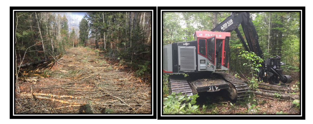
Maine Forestry – Silviculture