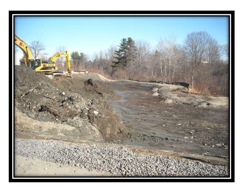
Cumberland County – Long Creek Watershed Management

• A total of $2,095,000 for one loan in FY 2009 (ARRA) for watershed management projects in the Long Creek Watershed.