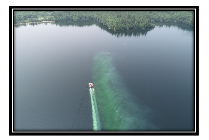
Auburn Lake – Alum Treatment

• A total of $400,000 in loans for phosphorus treatment of lakes as of 2019.