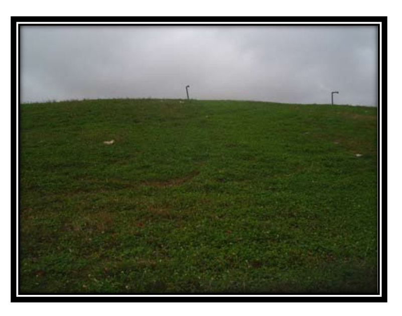
Greenville Landfill Closure

• A total of $14,555,194 in loans for landfill closures.