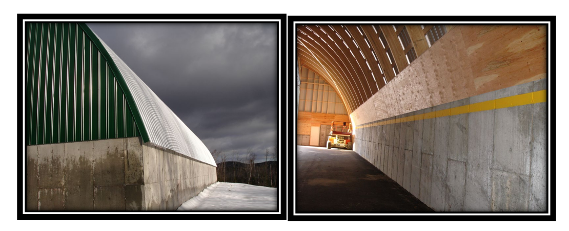
Hartford - Sand / Salt Shed

• Beginning in 2004 the DEP expanded the eligible use of funds for municipalities to design and construct sand/salt sheds in areas that the DEP has determined that ground water or surface water has been contaminated by sand/salt piles. The total of all salt/sand shed loans issued from the program is $3,406,074.